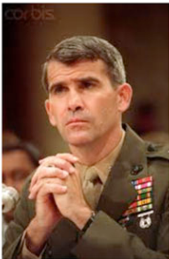
Oliver North at Iran-Contra Hearings

In 1989 I published the following article , “ Northwards without North: Bush, Counterterrorism, and the Continuation of Secret Power. ” It is of interest today because of its description of how the Congressional Iran-Contra Committees, in their investigation of Iran-Contra, assembled documentation on what we now know as Continuity of Government (COG) planning, only to suppress or misrepresent this important information in their Report. I was concerned about the committees’ decision to sidestep the larger issues of secret powers and secret wars, little knowing that these secret COG powers, or “Doomsday Project,” would in fact be secretly implemented on September 11, 2011. (One of the two Committee Chairs was Lee Hamilton, later co-chair of the similarly evasive 9/11 Commission Report).