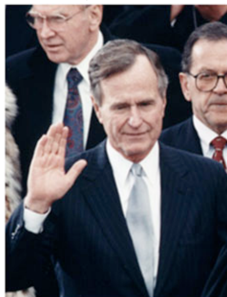
G.H.W. Bush 1989

Both levels availed themselves of their own special communications networks, Project 908 and FLASHBOARD, to avoid accountability to the regular administrative hierarchy.[12] Communications personnel for the first secret network were attached to the rarely mentioned White House Communications Agency (WHCA), an agency whose relevance to the JFK assassination and 9/11 I have outlined elsewhere.[13] Meanwhile Bush presided over a maze-like series of overlapping restricted groups and agencies with changing names, among which were the National Program Office and the Defense Mobilization Planning Systems Agency, responsible for the various Doomsday initiatives.[14]