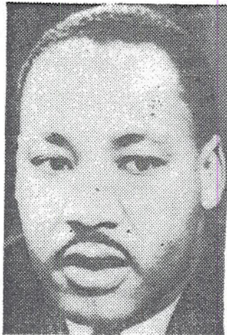
Dr. Martin Luther King

investigations of civil rights cases in the swamp country of Mississippi that the area is filled with "nothing but water moccasins, rattlesnakes and red-necked sheriffs, and they are all in the same category as far as I am concerned."