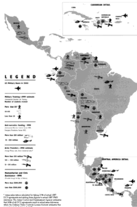
U.S. Military Programs in Latin America and the Caribbean

Three country studies on Mexico, Colombia, and Puerto Rico accompany Still Pulling Strings and provide a more in-depth account of how U.S. military policy affects these areas of Latin America and the Caribbean. These three documents can also stand alone as informative introductions to issues of militarism in each of the three countries.