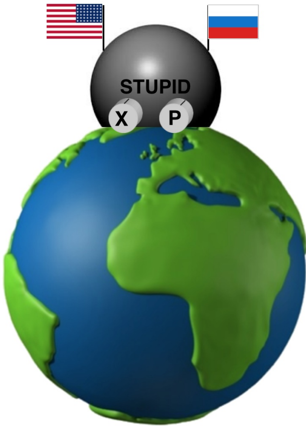
FIG. 1: We humans have invested great resources and ingenuity in building the Spectacular Thermonuclear Unpredictable Population Incineration Device , (acronym S.T.U.P.I.D.), whose two adjustable knobs determine its explosive power X and the probability P that it goes off spontaneously in any given year.

13.8 billion years after our Big Bang, about 500 years after inventing the printing press, we humans de-