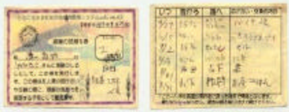
An example of a low-tech paper-based currency: the "Yufu" in the city of Yufuin, Kyushu.