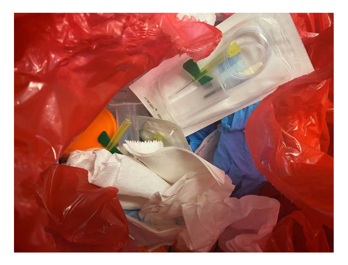
See also Ex. 3, Transcript of September 24 Meeting Recording, at 1–2. Biohazard bags are not puncture-proof, so this presented a serious risk to employees' safety.

245. That same night, Relator photographed ongoing HIPAA violations. Ventavia kept a calendar of patients to follow up with in public view in a reception area. The calendar contained patients' names and information. Similarly, patient records were left out in public view. Relator also documented that product cartons and patient randomization numbers from the BioNTech-Pfizer vaccine trial had been left in public view in a preparation area, potentially unblinding all Ventavia staff at the site and some patients as well: