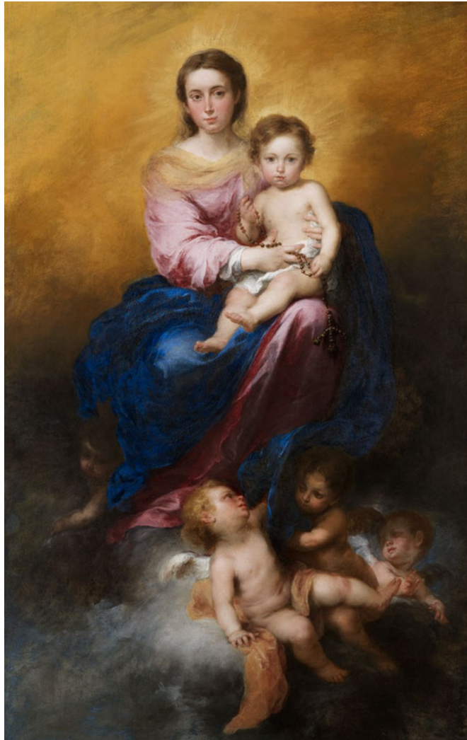
Virgin of the Rosary. Bartolome Esteban Murillo