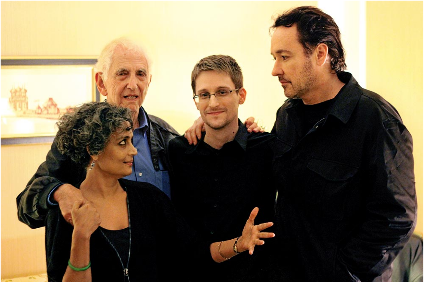
Room 1001, Ritz Carlton, Moscow: Edward Snowden's exiled quarters where actor-writer John Cusack brings Arundhati and Dan Ellsberg to meet him