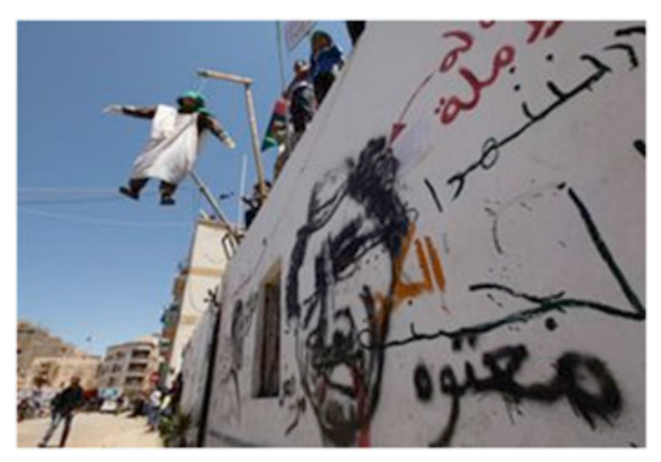
Benghazi group's Gaddafi effigy, May 22, 2011

The LIFG is a radical Islamic group which has been fighting small scale