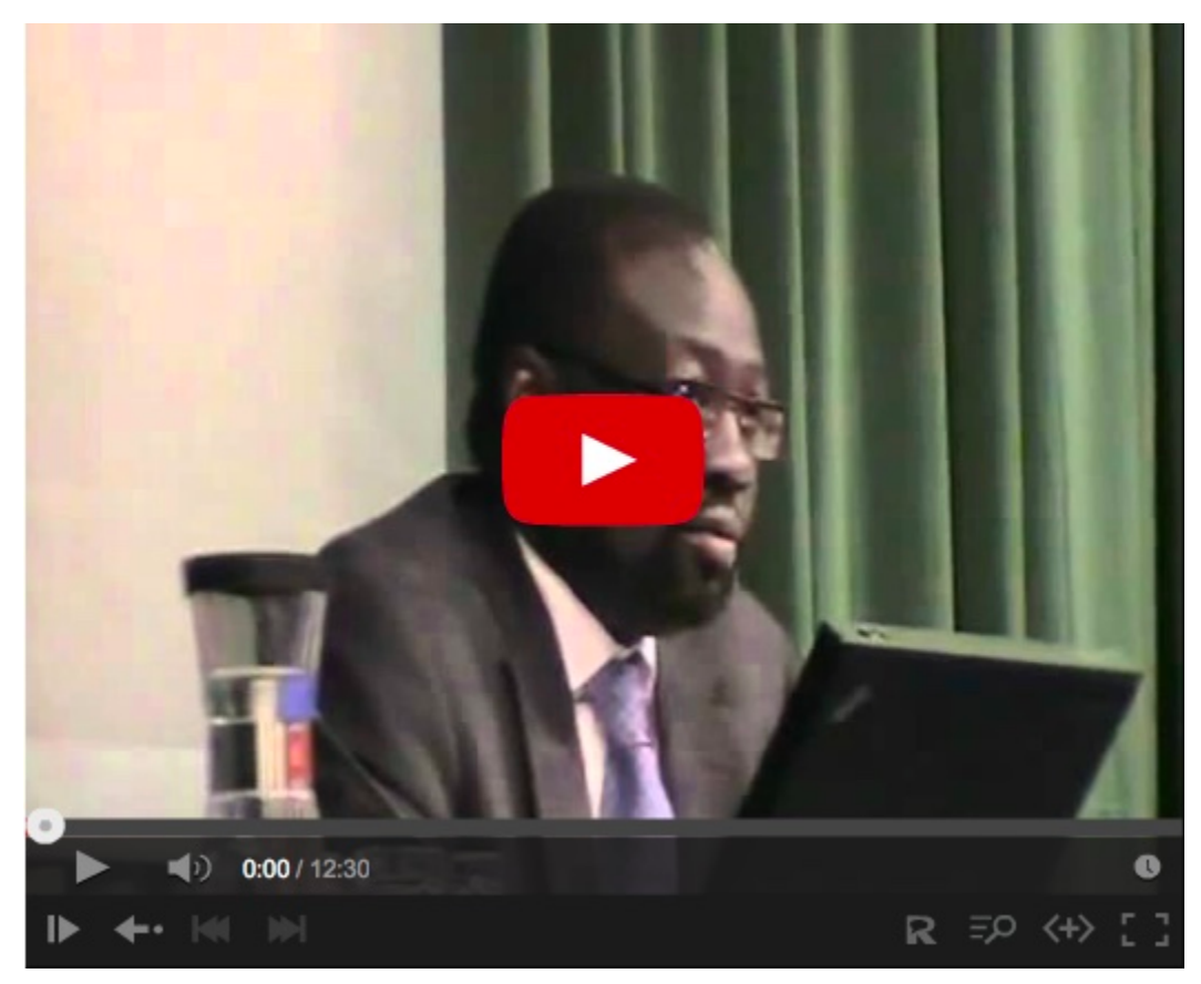
Raw Footage, Lumumba Di-Aping, December 11, 2009 [Running time: 12:30]

"I would rather die with my dignity than sign a deal that will channel my people into a furnace." -Lumumba Di-Aping