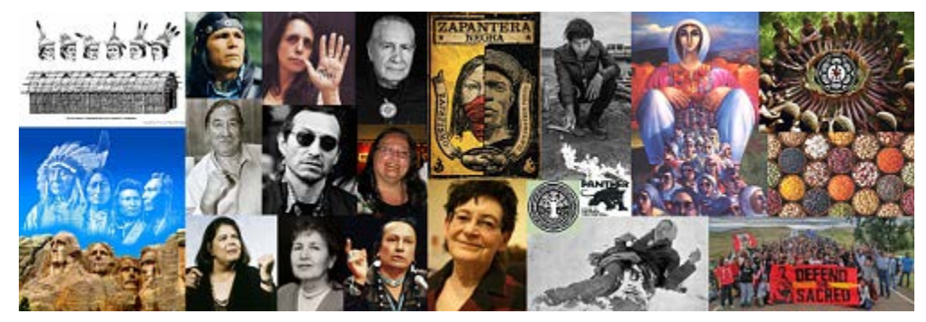
We Are Children Of Earth & Sky

There are many brilliant people and communities thinking about, practicing and expanding these ideas and actions that are the answer to the current global dilemma. If you are inspired, if you wish to share your vision of them, if you want to learn more, please contact us.