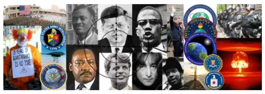
Military Intelligence Dominance

The framework is not yet at full power; of the intended 49 subtopics—see the linked list of 31 Second Tier Subjects in Table of Contents—19 remain to be implemented including Alternative Economic Systems, Climate Catastrophe, Drones and Targeted Assassinations, Electromagnetic Radiation (EMR) & Wireless Tech, Food Security, GI Resistance/Counter-Recruitment, and Nanotechnology.