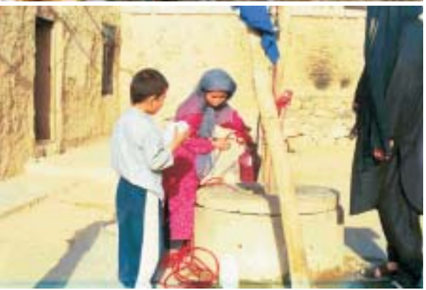
Figure 3. Water samples being taken from wells downwind from the explosion site in Bibi Mahro district, Afghanistan, in 2002 during the Uranium Medical Research Center's (UMRC) second field trip.