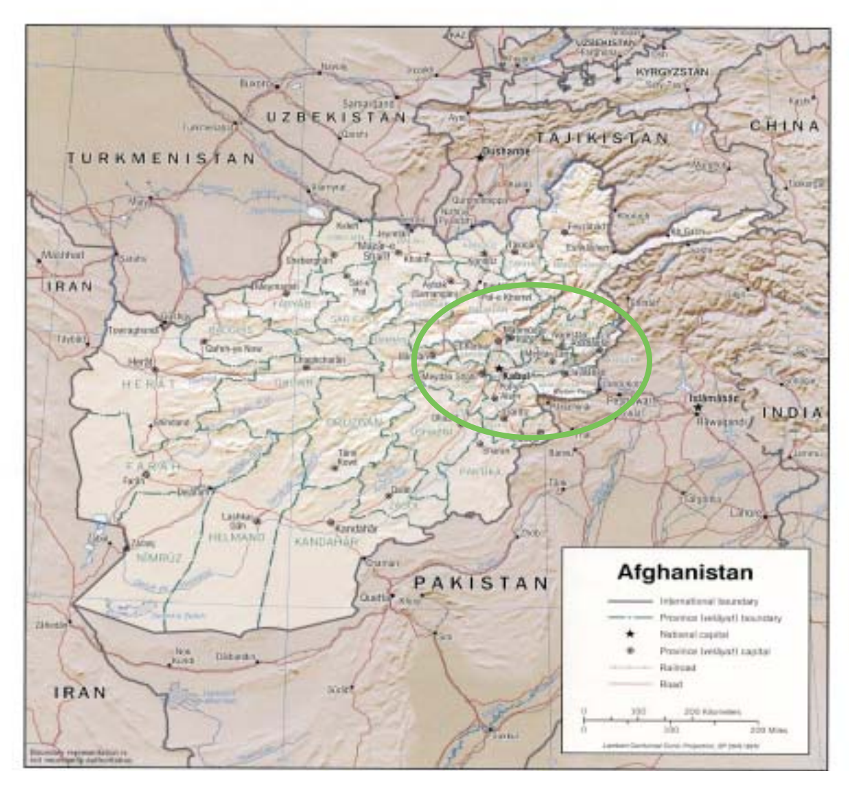
Figure 1. The areas of the Uranium Medical Research Center's (UMRC) field trips in eastern Afghanistan, 2002 (outlined).