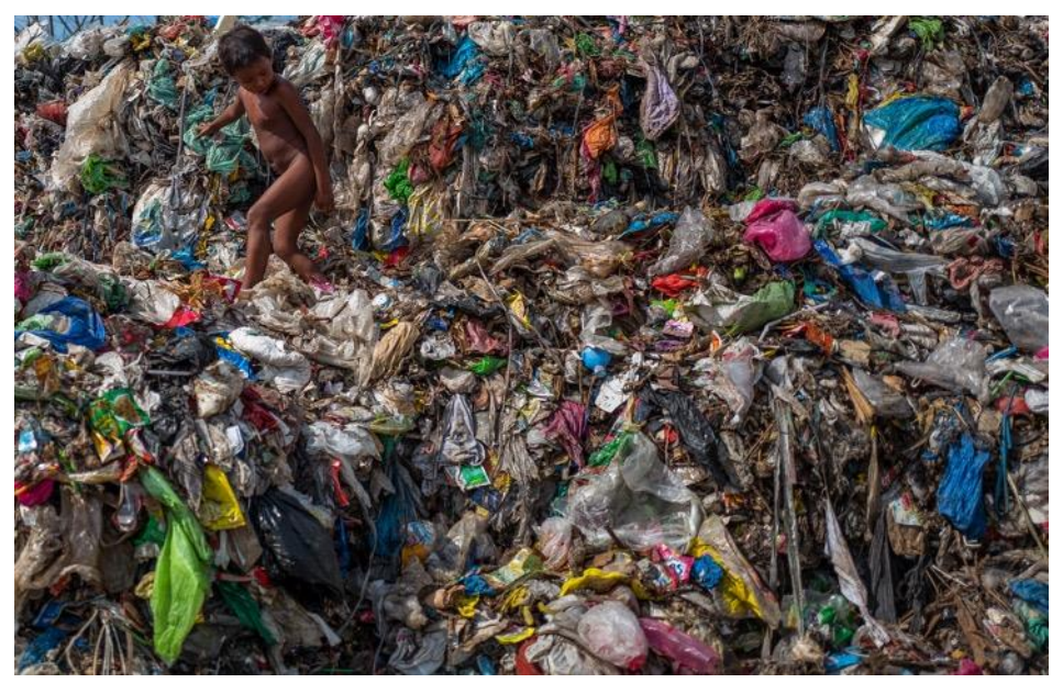
Photo taken while reporting for Orb in the Philippines. January 2017.

The contamination defies geography: The number of fibers found in a sample of tap water from the Trump Grill, at Trump Tower in Manhattan, was equal to that found in samples from Beirut. Orb also found plastic in bottled water, and in homes that use reverse-osmosis filters. 83 percent of samples worldwide tested positive for microscopic plastic fibers.