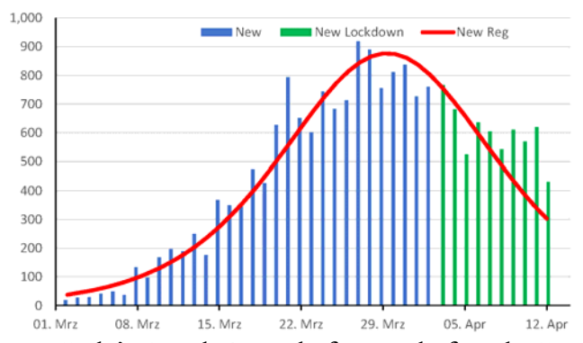
Figure 2: Italy's Death Rates before and after the Lockdown.

Outside China's Hubei province, the first lockdown took place in Italy. Hence, this country can be taken as a model case that deserves closer inspection. Figure 2 shows actual daily fatalities from the Johns Hopkins database as blue and green bars. The red line represents the density of the estimated logistic function.